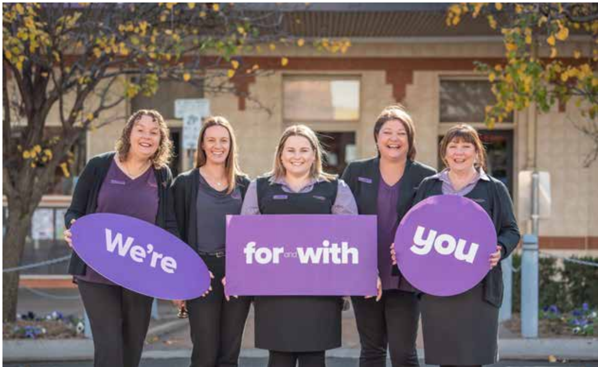
The Beyond Bank team in Leeton, on Wiradjuri land.