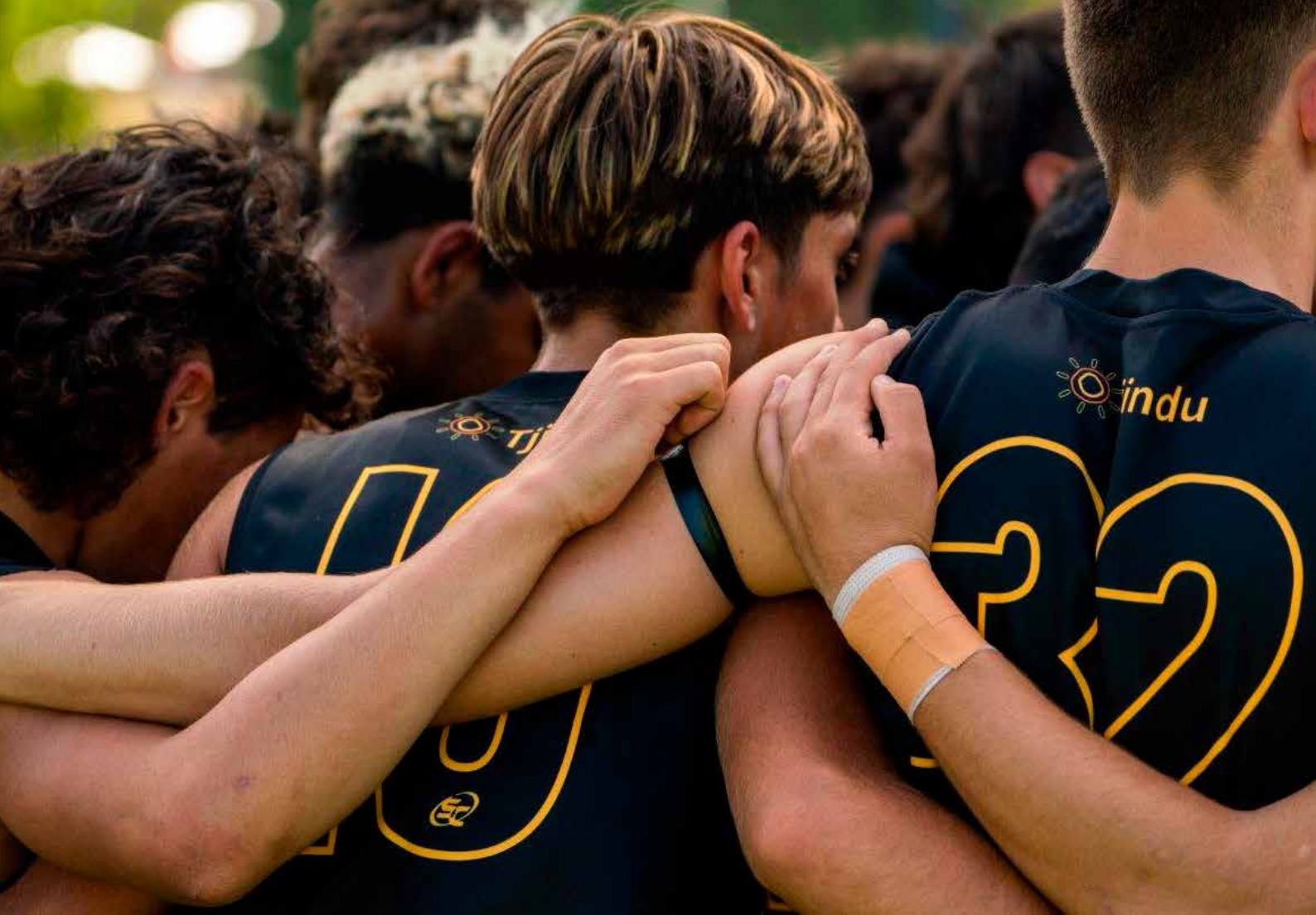
Tjindu Foundation Aboriginal AFL Academy Students pre-match on Kaurna Country.